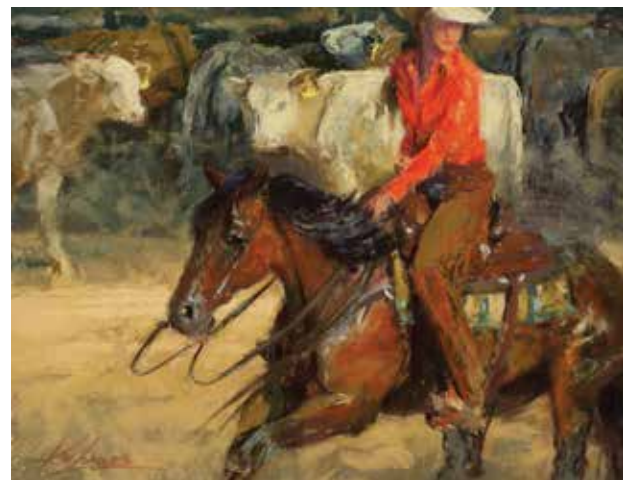
Kim Lordier, Livin' on a Loose Rein

In 2026, WA&A will continue its successful partnership with Delta Airlines, reaching elite members of the Delta Airlines Sky Club through complimentary distribution of the magazine at Sky Club lounges in airports across the country. Noted for luxury and excellence, Delta Sky Club services millions of guests annually. Sky Club members spend an average of two hours per visit where they have access to free Wi-Fi, beverages, special events and now WA&A and your advertising. This translates to even better exposure for your products and services.